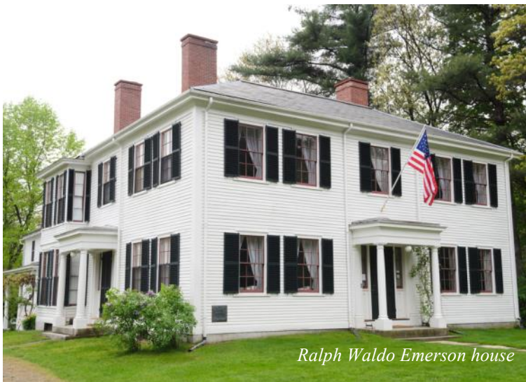
Ralph Waldo Emerson house