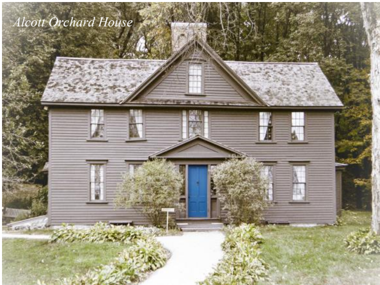
Alcott Orchard House