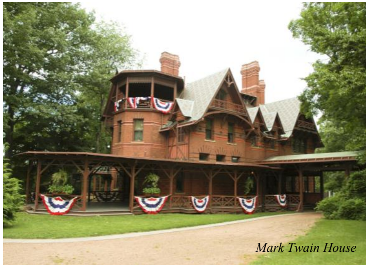
Mark Twain House