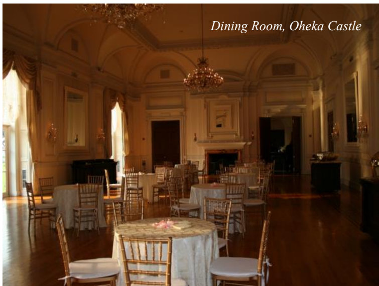
Dining Room, Oheka Castle