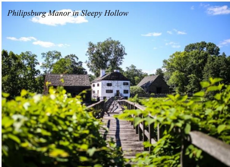
Philipsburg Manor in Sleepy Hollow